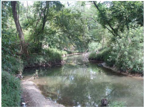
Country Club Bayou

More stops on the “Tour de Bayous” will take place in the fall, when it’s actually pretty pleasant to be outdoors on Houston area waterways! ●