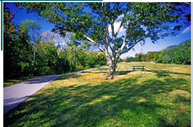
Trail at Terry Hershey Park

With the Bayou Greenway Initiative, Harris County residents can look forward to a more beautiful and natural landscape that provides excellent recreational opportunities. ●